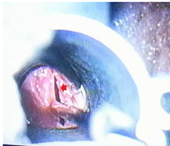
FIGURE 3 MICROLARYNGOSCOPIC VIEW OF GLOTTIS AFTER REMOVAL OF FOREIGN BODY SHOWING LACERATED VOCAL CORD MUCOSA (ARROW).