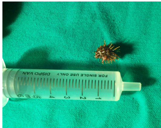
FIGURE 5 DIMENSIONS OF THE FOREIGN BODY MEASURING ABOUT 1CM IN DIAMETER