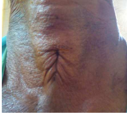
FIGURE 7 TRACHEOSTOMY SITE ON POST OPERATIVE DAY 27