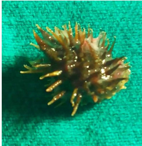
FIGURE 4 FOREIGN BODY (SEED WITH THORNY PROJECTIONS)