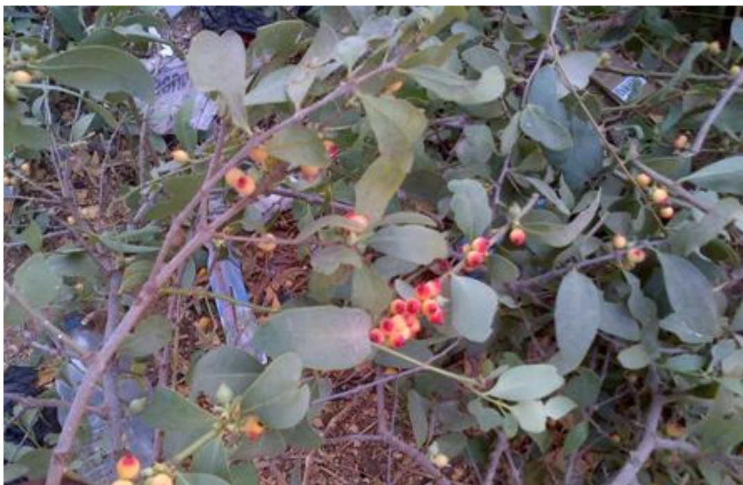
Plate 1 Picture of Tapinanthus dodoneifolius DC Danser.